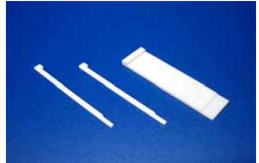
P/N: 22-00X-XXX FICO Ceramic Punch

Packing: 1 pc per vile. Minimum order: 2 pcs.